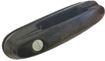
Part no. 8HF2SRDHRM

A guide for replacing an old style remote locking handle (inset) with a new style handle with cover.