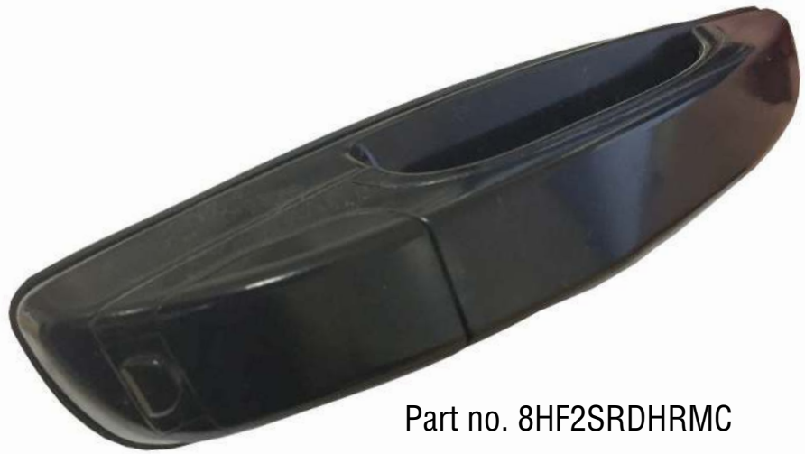
Part no. 8HF2SRDHRMC